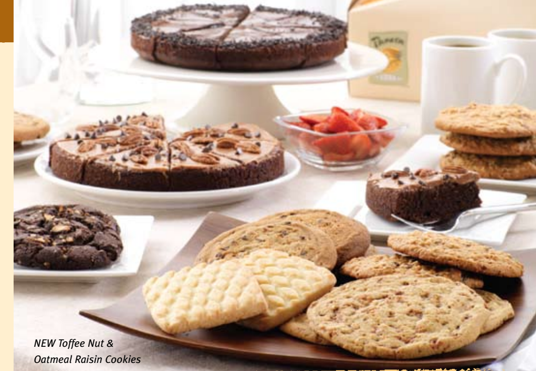
NEW Toffee Nut & Oatmeal Raisin Cookies

Ask your Catering Coordinator for today's soup selections.